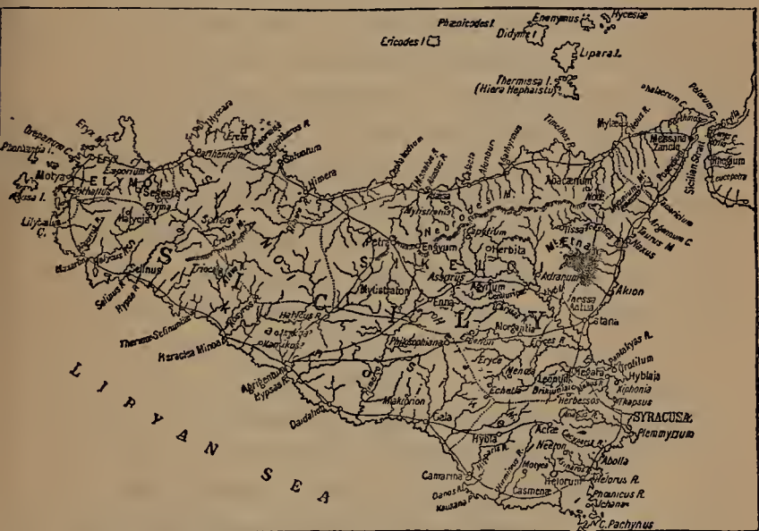
SICILY AND THE SCENE OF THE ATHENIAN CAMPAIGN BEFORE SYRACUSE